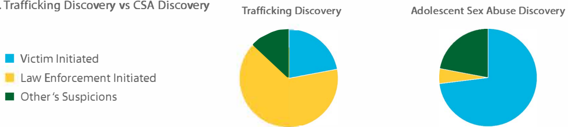
Figure 1. Trafficking Discovery vs CSA Discovery